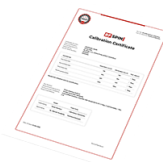
Factory calibration report